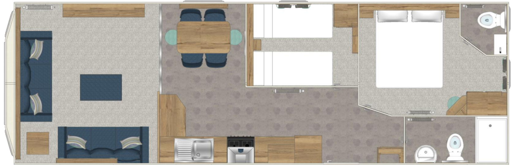
Upgrades/Changes From Standard 2021 Coworth

Carpet strip moved between living area and kitchen (window moved to be central)